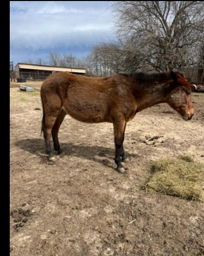
13 yo Molly mule 15.2 HH

Kate is a 13 yr old Molly mule Very gentle ketch anywhere rides or packs live or dead game carried wild hogs out on her live blood doesn't bother her been to Colorado several times packs out elk if you can sit the saddle and hold the reins you can ride her you can ride her up on the dogs bayed up with a hog and drop the reins on the ground and she will stay good for the farrier