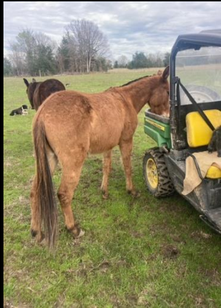
5 yo John mule 13.3 HH