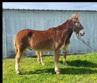
12 yo Molly & 13 yo John mule 16.1 & 16.3 HH

Dorothy and Fred are 12- and 13-years old draft mules, that are a good team for anybody to own. They both work single or double and ride very nice. They are very well mannered, easy to handle and to be around. From bathing, clipping, shoe/trim, harnessing and hooking up. They are the ones for any type of event. Such as riding down the trails under the saddle or hooked up working down town through the busy streets. You can also use either mule to put beside a new beginner animal for training and they will show them the way. Dorothy and Fred are a all-around versatile team that will fit in anyone's life style.