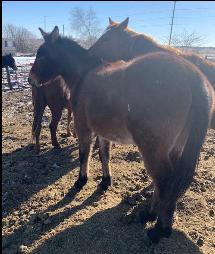
2 yo John mule 14.0 HH

Cahill is a 2 year old john mule that is ready for someone to take in any direction. He is out of our Docs Hickory mare and a son of Choice. He has a sweet disposition and if he is anything like the other mules and horse colts out of this mare you will be glad that you own him and not someone else. He is cowbred and her progeny will always be the ones that you can ranch off of or you can trail ride. They are quick to learn and please. Do not miss this one!