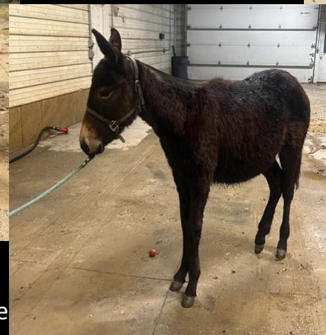
Black yearling Molly mule out of cow bred registered mare. Halter broke.