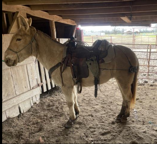
9 yo Molly mule 14.0 HH

LOGAN MARTIN – CLARKSVILLE, TX 903-556-4870