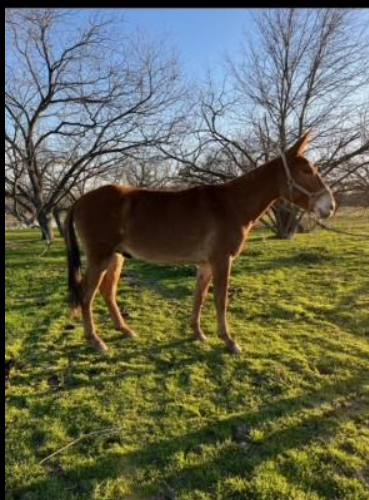
2 yo John mule 15.3 HH