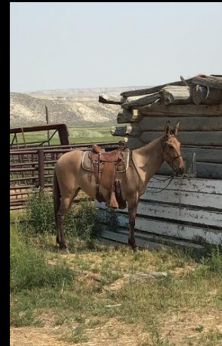
13 yo Molly mule 15.0 HH