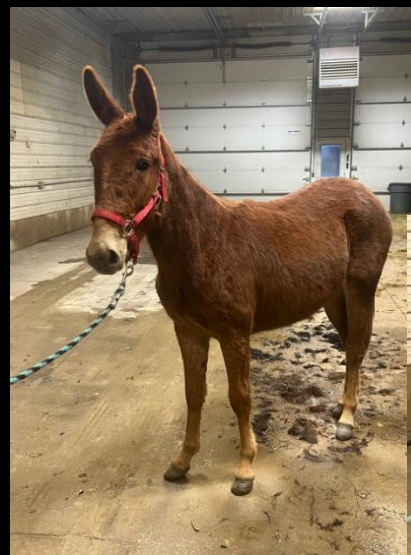
Coming 2 year old Molly mule. She is halter broke and really athletic and out of a registered running bred mare