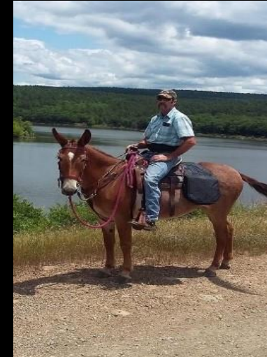
15 yo Molly mule 15.2 HH

TOMMY KENDRICK – WILBURTON, OK 918-448-9328