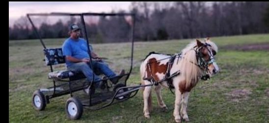
5 yo Shetland pony 36 inch 406 lbs