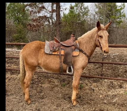
7 yo John mule 15.0 HH

Buck is a 7 year old Palomino Jon mule that stands 15 hands. He is one very fancy guy and has lots of go to him. He is well broke and will go anywhere you ask him to go. He has sorted cows, packed and has been hog hunted off of. He is also good with his ears and feet.. Buck has had 45 days of Amish training this year.